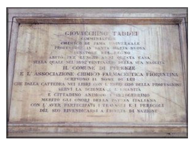
Commemorative plague of Giacchino Taddei attached to his home-wall in San Miniato, Pisa.

3.2 Gioacchino Taddei (1792-1860) was the successor of Gazzeri as Superintendent and teacher of Pharmaceutical Chemistry. He was involved in several researches: corn gluten, quality of the city water in Florence, and mercury poisoning. He also published a notable book entitled "General Pharmacopoeia". In late 1848 he was suspended from teaching due to the role of head of the Tuscan Parliament following the 1848 revolution. He was reintegrated in his teaching duties only in 1859, following the collapse of the Grand-Ducky of Tuscany and after the Italian unification was nominated senator of the Italian Kingdom.